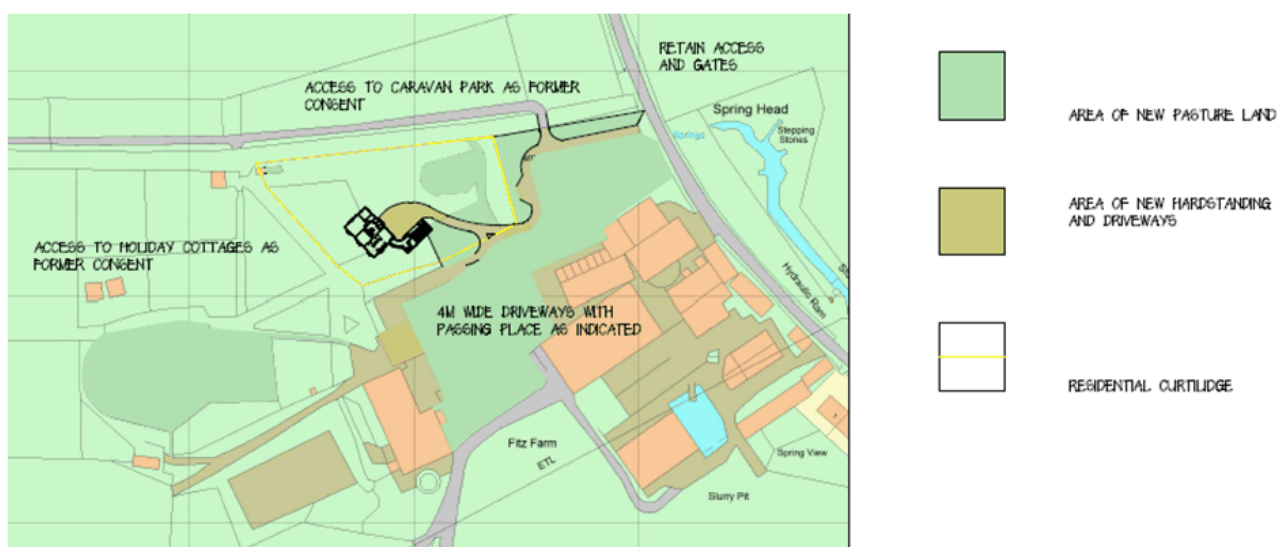
Site Plan – Proposed

One visitor attraction building would be retained to accommodate the applicant's horses.