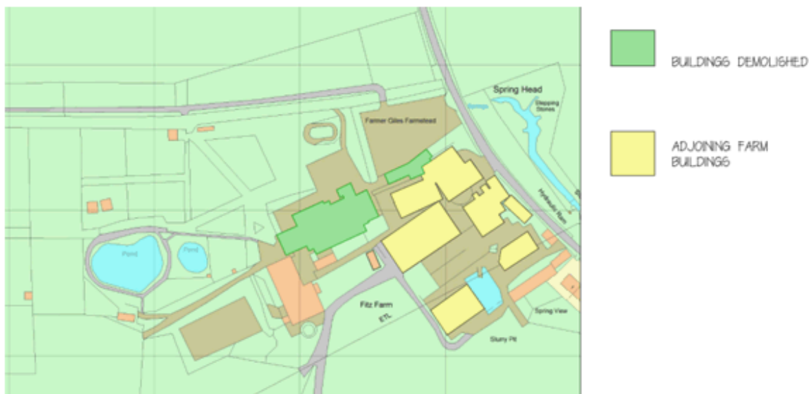
Plan showing buildings to be demolished

and stored mobile home would also be removed. All land under the removed buildings and car park would be restored to pasture, although with a driveway retained to serve the proposed dwelling.